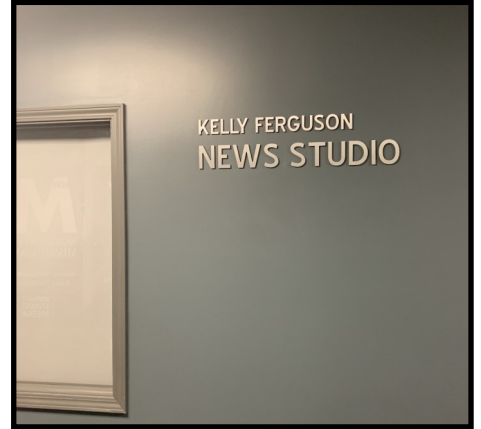
Wells 233 Newsroom