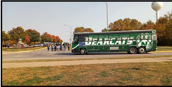
Bus in the Homecoming parade