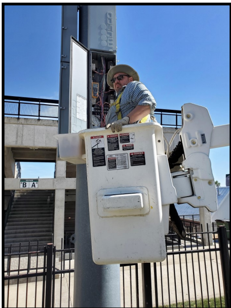
Stadium Light Repairs