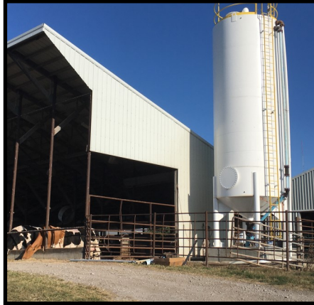
New Dairy Flush Tank