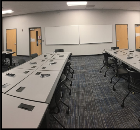
Colden 1350 CSIS Lab